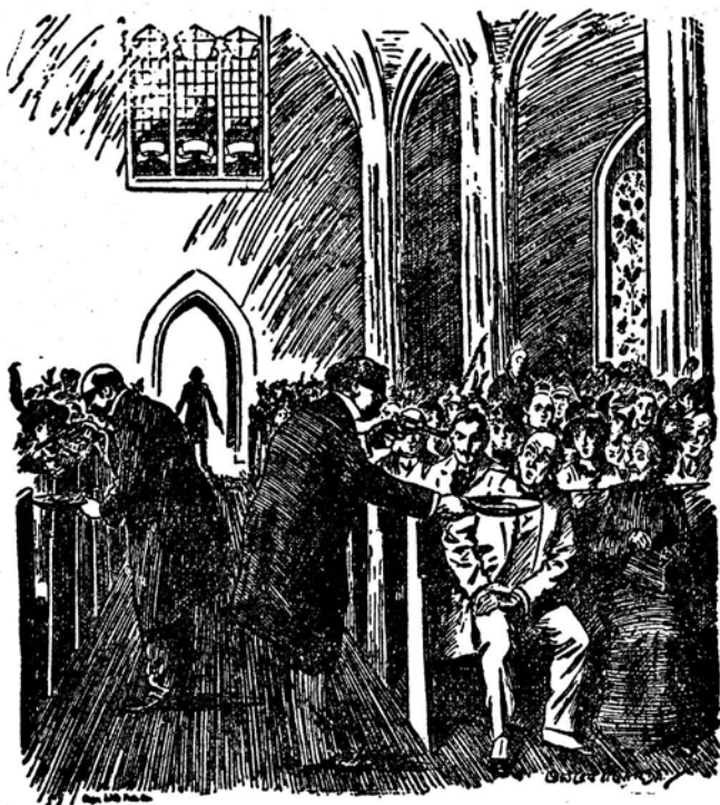
A MORE HONORABLE WAY

Again the money-changers are operating in the house of the Lord, and again seem appropriate the words of the Master: "It is written, My